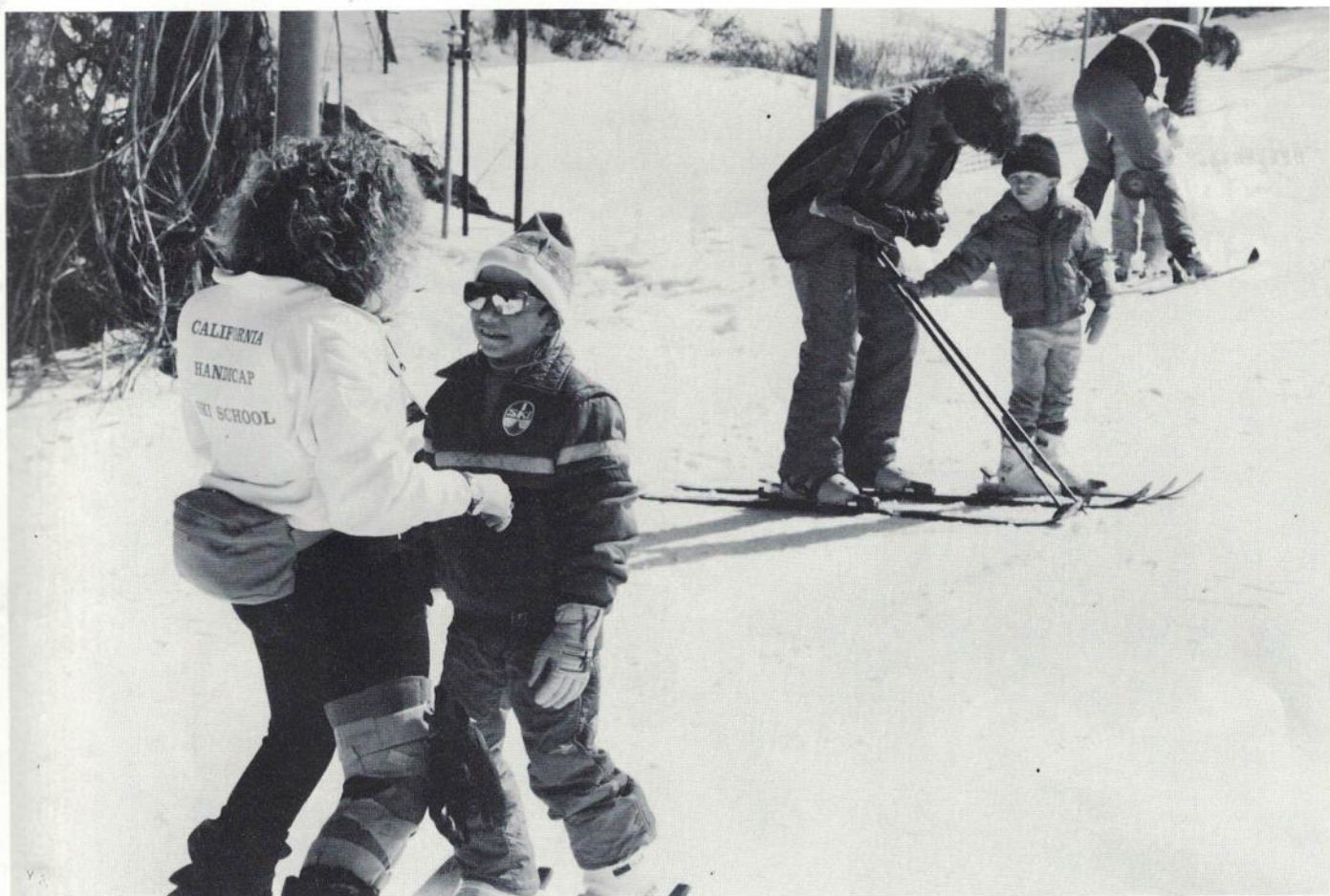
First, the kids must get the feel of their boots, skis and the snow.