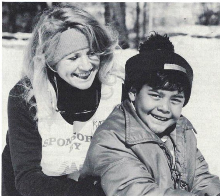
The joy of skiing shines on the faces of both the student and instructor.

Last year, the foundation ran a four-day learn-to-ski clinic at Goldmine Ski Area (now called Bear Mountain Ski Resort) at Big Bear Lake, Calif. The success of the clinic helped convince the foundation's trustees of the need for a permanent ski school for the handicapped in Southern California. Currently, there are four others in the United States; three in Colorado and one at Alpine Meadows at Lake Tahoe.