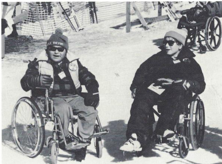
Anxiously awaiting their turn on the sit-ski.