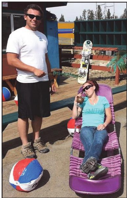
When not teaching, interns have other important responsibilities.

As my senior year at Texas State University started to drift away I had an important decision to make: Where do I want to do my internship? There were several options: Texas, of course, Utah, California, Colorado, etc. What I