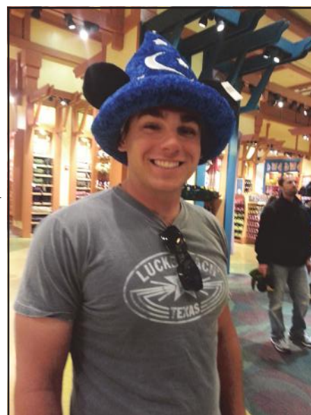
In a manner of speaking, interns are the sorcerer’s apprentice.