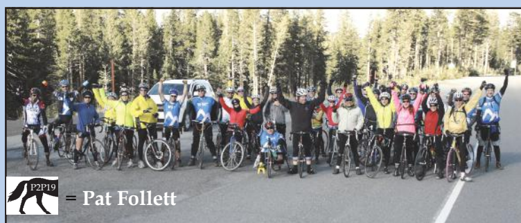
The crew regroups to finish together at Mammoth Mountain.

obstacles, to know accomplishment, to feel elation. In short, Peakers are able, in some small way, to understand what many USARC program participants experience. Add to that the making of new friends, and the renewal of old friendships, and it doesn't get much better.