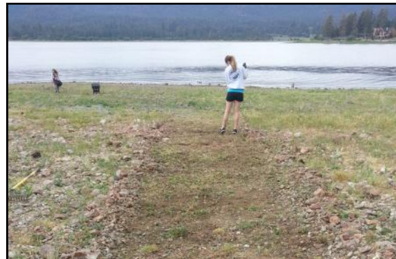
Intern helps create a new path to the shore.

The USARC's success, and that of our participants, is due to many collaborative partners, including Casa Colina Hospital with whom we