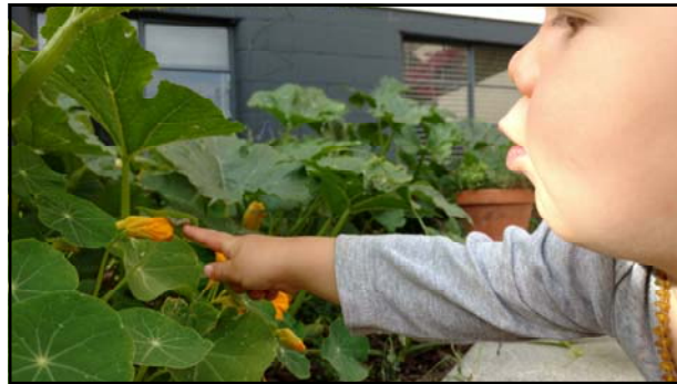
A little boy points out a Monarch caterpillar, soon to become something even more beautiful.

the garden, then locks itself away, to eventually emerge as something quite beautiful. It even factored into my end-of-season speech about transitions to our wonderful volunteers.