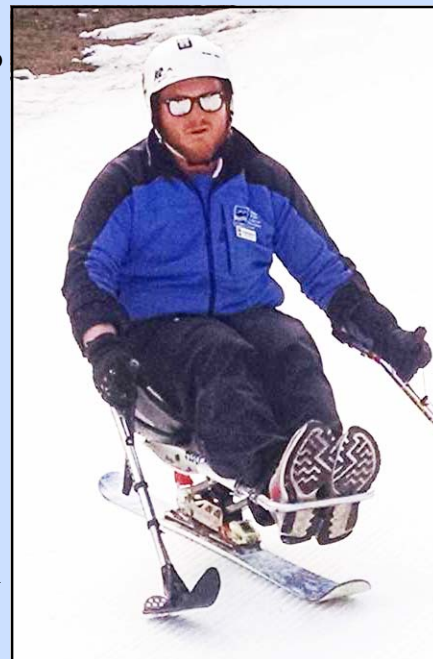
Intern knows to best teach mono-ski, one must mono-ski.

At the beginning I didn't know what to expect from this internship, and I did not even know if I would like to teach skiing, let alone adaptive skiing. Now that it has passed, I can proudly say that it is the staff, participants and volunteers that I was around every day who made it all worthwhile and something that I have fallen in love with. This has been the best adventure of my life! Thank you USARC for everything you have done for me and I will see you again during the 2016/17 winter season as a staffer (with a name!)