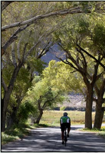
Soothing shade trees welcome riders to Lake Diaz.

Big or small, crowded or not, new riders or old, the annual Peak to Peak Pedal is always an experience full of challenges, rewards and feel-good. While the 21st iteration of the ride did not have the same number of riders as its predecessor, it more than made up for it in other ways.