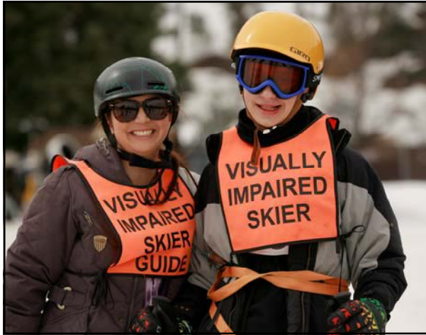
Hope and Petras are all smiles during a lesson.

of the United States Adaptive Recreation Center