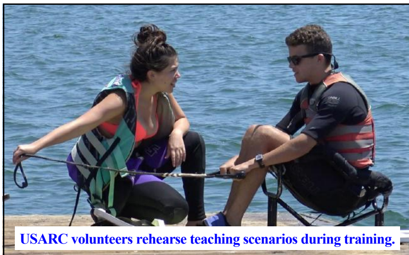
USARC volunteers rehearse teaching scenarios during training.