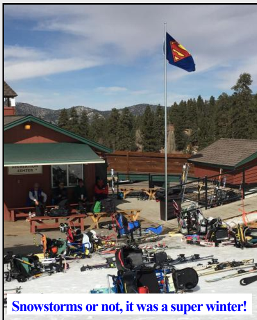
Snowstorms or not, it was a super winter!

REALLY? That was winter? This “snow-sports” season was definitely a weird one, and with temps reaching the 60’s during most of the months, Big Bear didn’t really turn into the Winter Wonderland for which we all continue to wait. Yet we adapted.