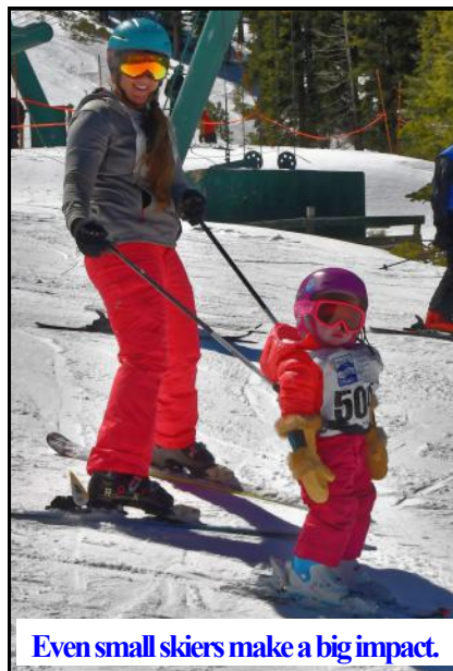
Even small skiers make a big impact.