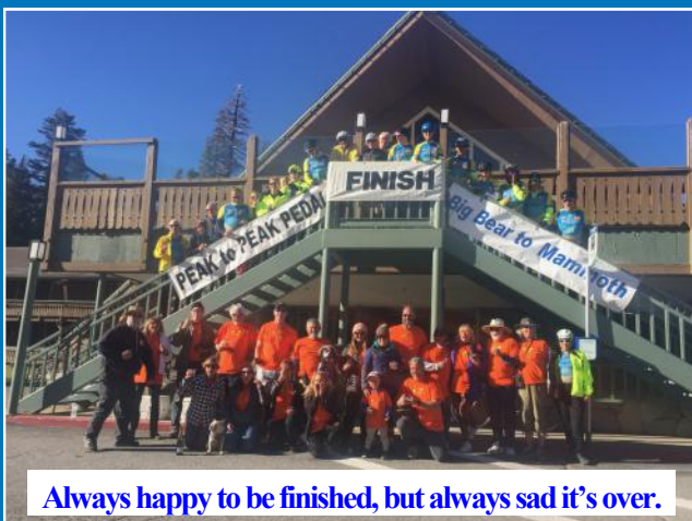
Always happy to be finished, but always sad it's over.