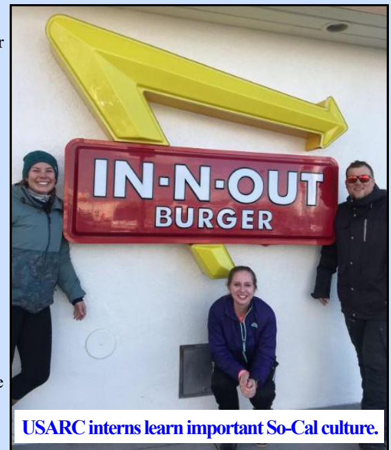
USARC interns learn important So-Cal culture.