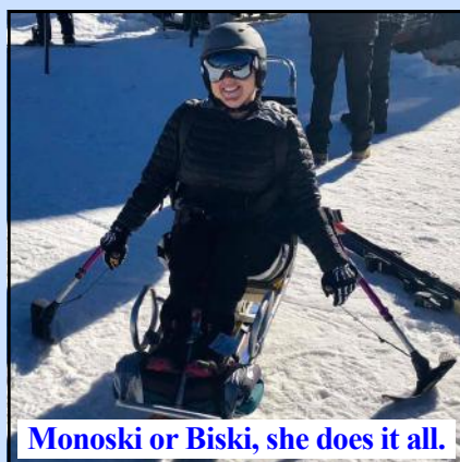
Monoski or Biski, she does it all.

T: Recreation is a huge part of my life. You don't have to be a sports enthusiast's athlete, but simply being outdoors, pushing your limits and going outside your comfort zone results in a