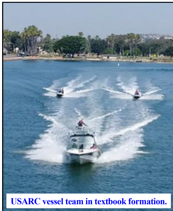
USARC vessel team in textbook formation.

As indicated to the left, during the recent winter Big Bear Lake filled up quite a bit, yet still sits about nine feet below its ideal elevation of 6,740 feet above sea level.