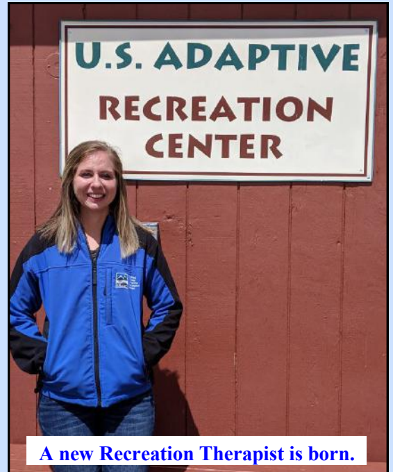
A new Recreation Therapist is born.

As a final thought, I cannot express how much I have enjoyed my time here. The work was meaningful as it was, but that was only a small part of what made my internship feel so special. Seeing everyone's dedication is something I won't forget and the endless amount of knowledge I have gained as an intern.