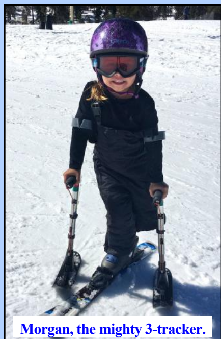
Morgan, the mighty 3-tracker.

Think about it. The Big Bear Lake Municipal Water District might have addressed the low lake level by simply asking every visitor to the valley to pour one gallon of water in the lake (but that would have meant a lot of traffic and plastic water jugs needing recycling.) Instead, mother nature cut out the middle-man and, over the course of a long-awaited big winter, finally dumped her bounty into the lake in the form of 20,000 acre-feet of water, or 65 billion gallons.