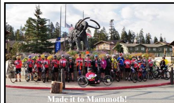
Made it to Mammoth!