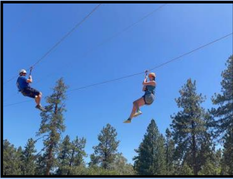
DJ and Pales zipping through the sky

An addition to our summer programming was the Snow Summit Adventure Day. In partnership with Snow Summit we were able to offer all the base area activities available. Our athletes were able to tackle an array of activities ranging from cruising down the summertime Tubing Hill to flying through the air on a Zipline.