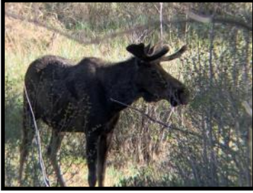
I was very excited to see a Moose in Colorado

Time flies when you're having fun...or busy. Another summer has come and gone, the peak to peak pedal has rolled by, the weather is changing, snow guns are getting tested, and we are preparing for another winter to be upon us.