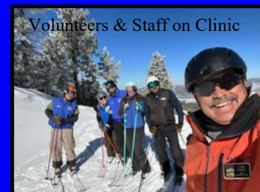
Volunteers & Staff on Clinic

Who is excited for winter? You know that our USARC crew is! After a wonderful summer season out on the lake and a very successful Peak to Peak ride, we are changing gears in preparation of our winter season. The temperatures are dropping in Big Bear and there are storms in the forecast! We never know what kind of winter we will get but are hopeful for a good one this 2022-2023 season!